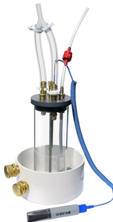
The RAD AQUA accessory

This accessory enables users to accurately measure radon in large water samples of up to 2.5L in volume, collected in standard soda bottles or glass jugs. Large samples allow for greater precision and lower limits of detection. Radon concentrations of as low as 1 pCi/L (37 Bq/m 3 ) can be detected with a sufficiently large sampling bottle. The upper operating limit of the Big Bottle System is 10,000 pCi/L (370,000 Bq/m 3 ). Ranges higher than that are detectable with the RAD H 2 O accessory.